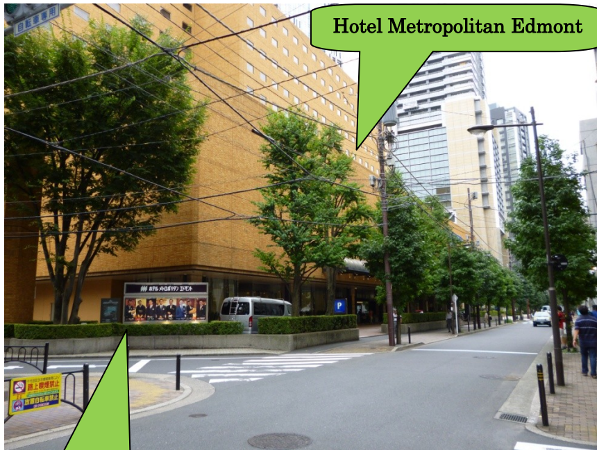
Hotel Metropolitan Edmont

(5) After you walk straight for a while, you can see Hotel Metropolitan Edmont on your left.