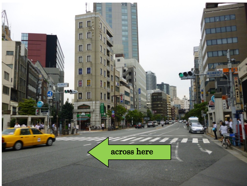
The junction of five roads

(2) Soon you arrive at a junction of five roads. Across the biggest road (Mejiro Dori).