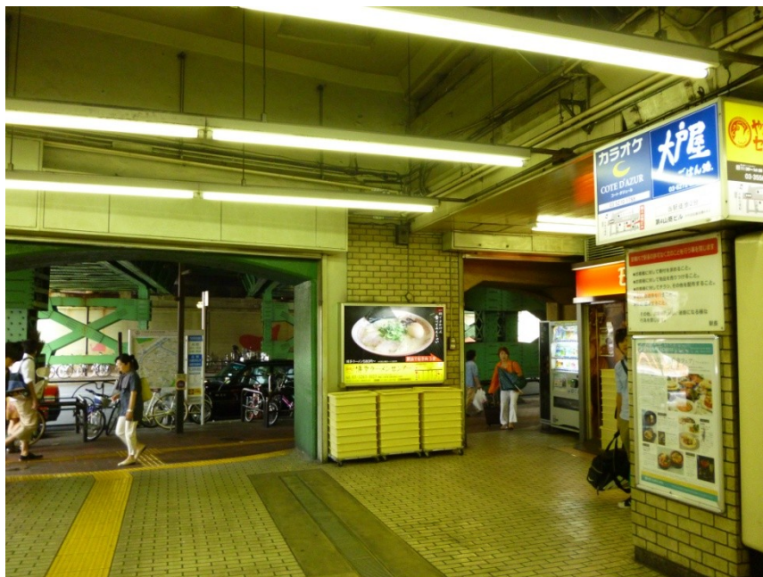
In front of the east exist of Iidabashi Station (JR)

(1) After you go down the stairs and pass through a ticket gate of the east exist of Iidabashi Station (JR), turn right.