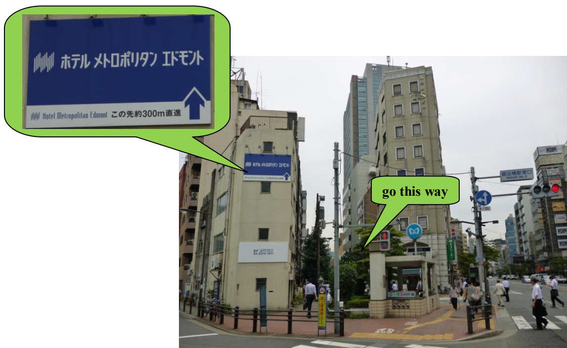
A signboard of Hotel Metropolitan Edmont

(3) In the junction of five roads, you can see a signboard of Hotel Metropolitan Edmont. Go into the road between the signboard and MOS burger.